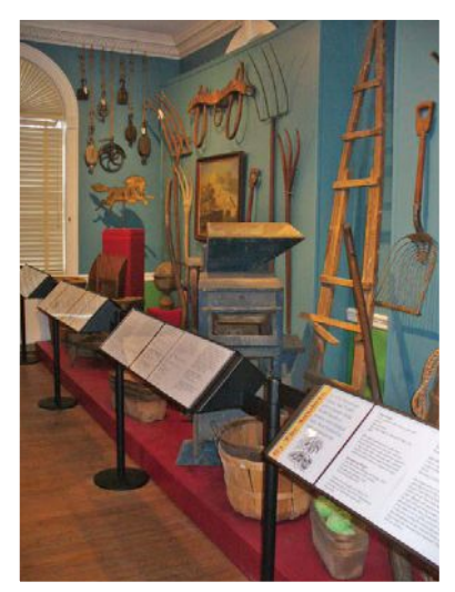
Monmouth County Historical Association Freehold, New Jersey