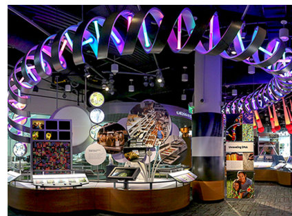
North Carolina Museum of Natural Sciences Raleigh, NC

Agua Caliente Cultural Museum - Palm Springs, CA The Amistad Center for Art & Culture - Hartford, CT Boca Raton Museum of Art - Boca Raton, FL Chinese American Museum - Los Angeles, CA Civil Rights Institute of Inland Southern California - Riverside, CA Cosmosphere - Hutchinson, KS Crocker Art Museum - Sacramento, CA Crystal Bridges Museum of American Art - Bentonville, AR Dallas Holocaust Museum Center - Dallas, TX Evansville Museum of Arts, History & Science - Evansville, IN Fairfield University Art Museum - Fairfield, CT Grounds for Sculpture - Hamilton, NJ Guadalupe Cultural Arts Center - San Antonio, TX Gulf Coast Exploreum Science Center - Mobile, AL The Haggin Museum - Stockton, CA High Desert Museum - Bend, OR Historical Society of Washington, DC - Washington, DC Holocaust Memorial Center - Farmington Hills, MI i.d.e.a. Museum - Mesa, AZ J. Paul Getty Museum - Los Angeles, CA James A. Michener Art Museum - Doylestown, PA Long Beach Museum of Art - Long Beach, CA Long Island Children's Museum - Garden City, NY