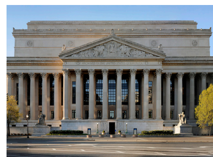
National Archives Foundation Washington, DC