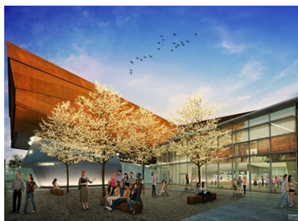
Dallas Holocaust Museum Center for Education and Tolerance Dallas, TX