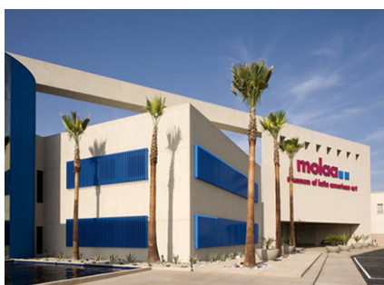
Museum of Latin American Art Long Beach, CA