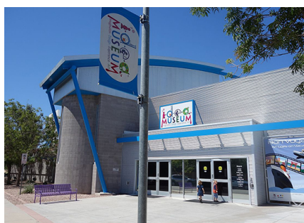
i.d.e.a. Museum Mesa, AZ

Massachusetts Air and Space Museum - Boston, MA Mississippi Arts and Entertainment Experience - Meridian, MS Montclair Art Museum - Montclair, NJ Monterey Museum of Art - Monterey, CA Museum of Latin American Art - Long Beach, CA Musical Instrument Museum - Phoenix, AZ National Archives Foundation - Washington, DC National Czech & Slovak Museum & Library - Cedar Rapids, IA National Underground Railroad Freedom Center - Cincinnati, OH North Carolina Museum of Natural Sciences - Raleigh, NC Orange County Museum of Art - Newport Beach, CA Palm Springs Art Museum - Palm Springs, CA Pasadena Museum of California Art - Pasadena, CA Phoenix Art Museum - Phoenix, AZ Plains Art Museum - Fargo, ND San Bernardino County Museum - Redlands, CA San Diego Chinese Historical Museum - San Diego, CA San Jose Museum of Quilts & Textiles - San Jose, CA Seminary Ridge Museum - Gettysburg, PA Skirball Cultural Center - Los Angeles, CA Smithsonian Institution - Washington, DC Yakima Valley Museum - Yakima, WA