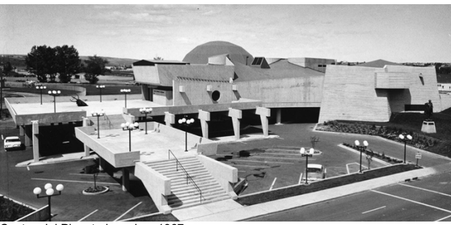
Centennial Planetarium circa 1967

Curatorial leadership will be essential to shaping the gallery's future, particularly with Contemporary Calgary's capital renovation and expansion project. This initiative provides a significant opportunity to redefine the experience of contemporary art exhibitions. The project includes renovations to the existing Planetarium, the expansion of a new education and programming wing, and the transformation of the Centennial Planetarium Dome into Canada's first LED dome dedicated to contemporary art. These developments present an exciting opportunity for Contemporary Calgary to lead the way in art innovation, and the gallery looks forward to the guidance and expertise of its Chief Curator in bringing this project to life.