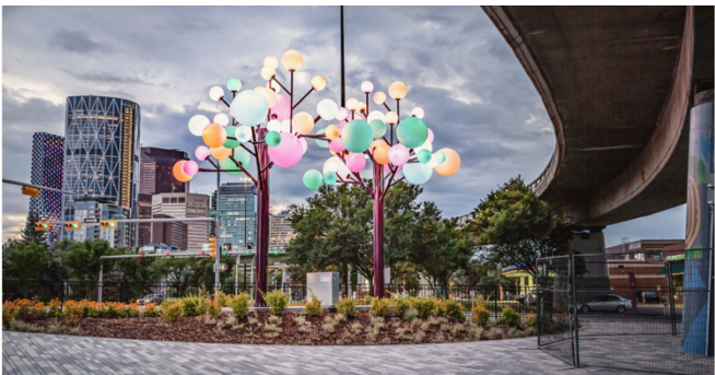
Fly Over Park, Bridgeland, Calgary, Alberta.