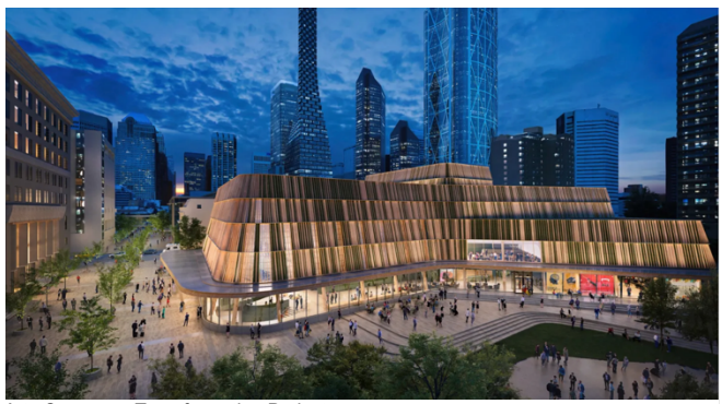
Arts Commons Transformation Project